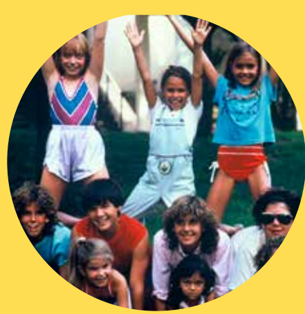
THEN Summer 1984 The first camp for 10 kids