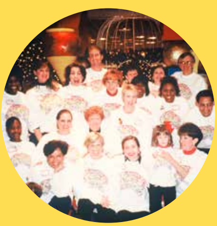
THEN Circa 1993 Rainbow Days Staff