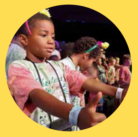
NOW Camp Bravo 2017 with 295 kids